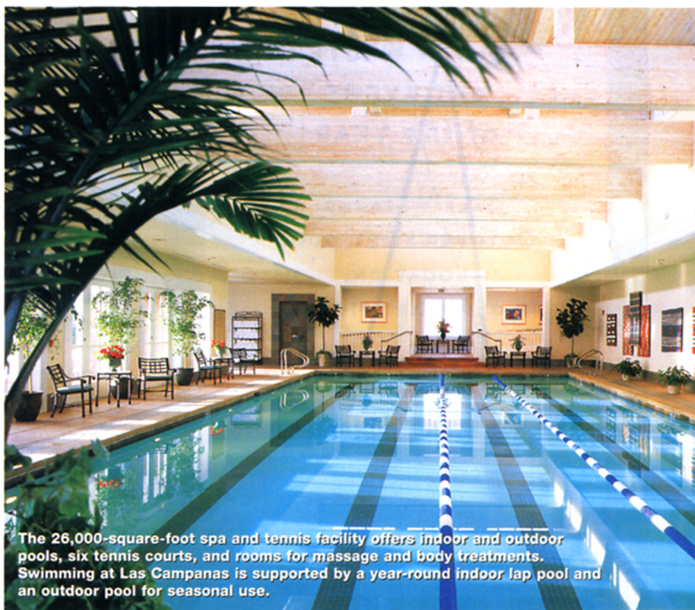
The 26,000-square-foot spa and tennis facility offers indoor and outdoor pools, six tennis courts, and rooms for massage and body treatments. Swimming at Las Campanas is supported by a year-round indoor lap pool and an outdoor pool for seasonal use.