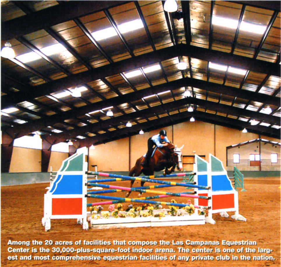
Among the 20 acres of facilities that compose the Las Campanas Equestrian Center is the 30,000-plus-square-foot indoor arena. The center is one of the largest and most comprehensive equestrian facilities of any private club in the nation.