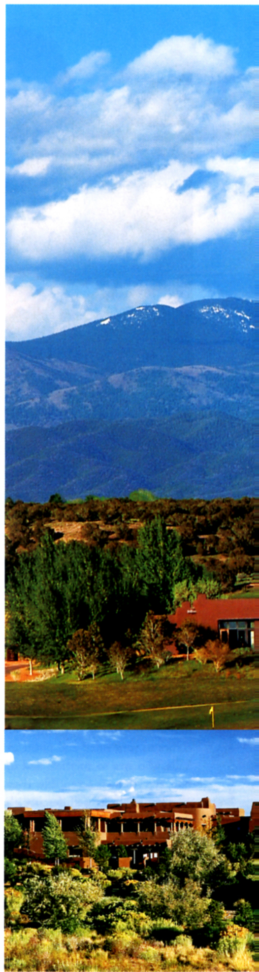
RANCH CLUBHOUSE