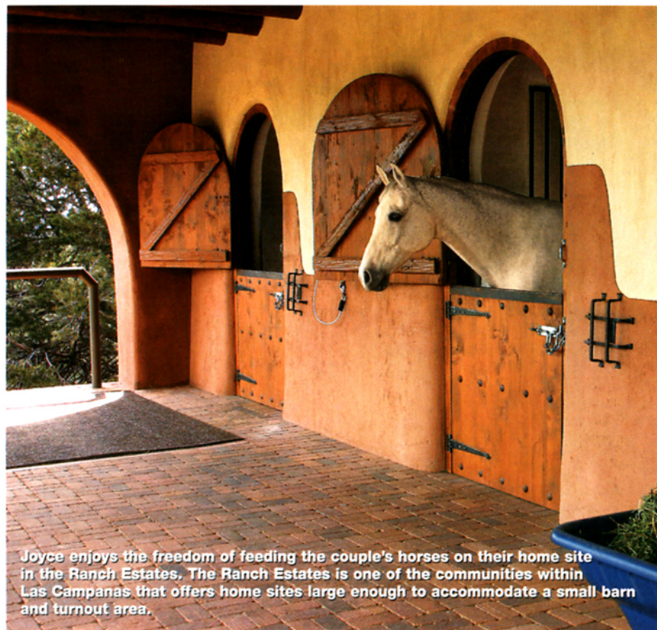
Joyce enjoys the freedom of feeding the couple's horses on their home site in the Ranch Estates. The Ranch Estates is one of the communities within Las Campanas that offers home sites large enough to accommodate a small barn and turnout area.

indoor riding arena, outdoor arena, reining pen, regulation-size dressage court, and a boarding and training barn with more than 90 stalls. It also offers full-service care and training to members and has a full-service show barn that travels on the Southwestern circuit. With opportunities for stabling, training, and riding, the equestrian center lies at the heart of the community.