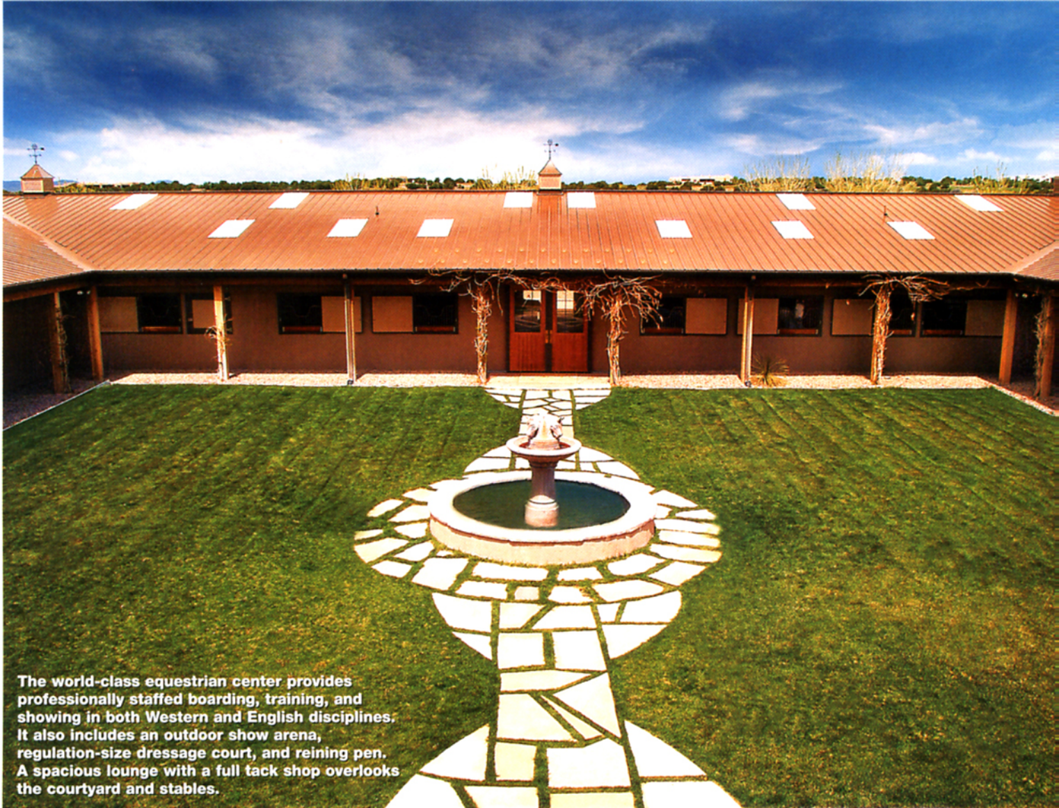
The world-class equestrian center provides professionally staffed boarding, training, and showing in both Western and English disciplines. It also includes an outdoor show arena, regulation-size dressage court, and reining pen. A spacious lounge with a full tack shop overlooks the courtyard and stables.