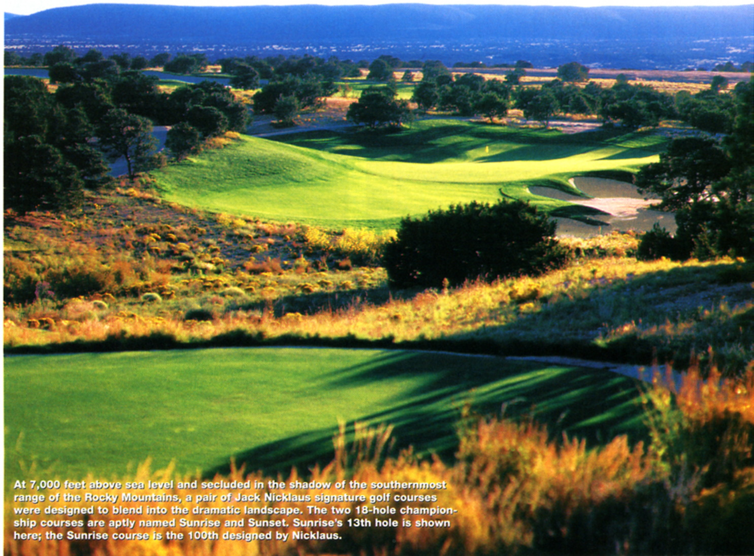
At 7,000 feet above sea level and secluded in the shadow of the southernmost range of the Rocky Mountains, a pair of Jack Nicklaus signature golf courses were designed to blend into the dramatic landscape. The two 18-hole championship courses are aptly named Sunrise and Sunset. Sunrise's 13th hole is shown here; the Sunrise course is the 100th designed by Nicklaus.

trian center, the community boasts a lavishly appointed 26,000-square-foot spa and tennis facility, dining at the Main Dining Room or The Mixed Grill—located at the award-winning Hacienda Clubhouse—as well as two 18-hole championship golf courses designed by Jack Nicklaus. Aptly named Sunrise and Sunset, the members-only golf courses offer some of the best places to view the rising and setting sun against the mountain-filled skyline.