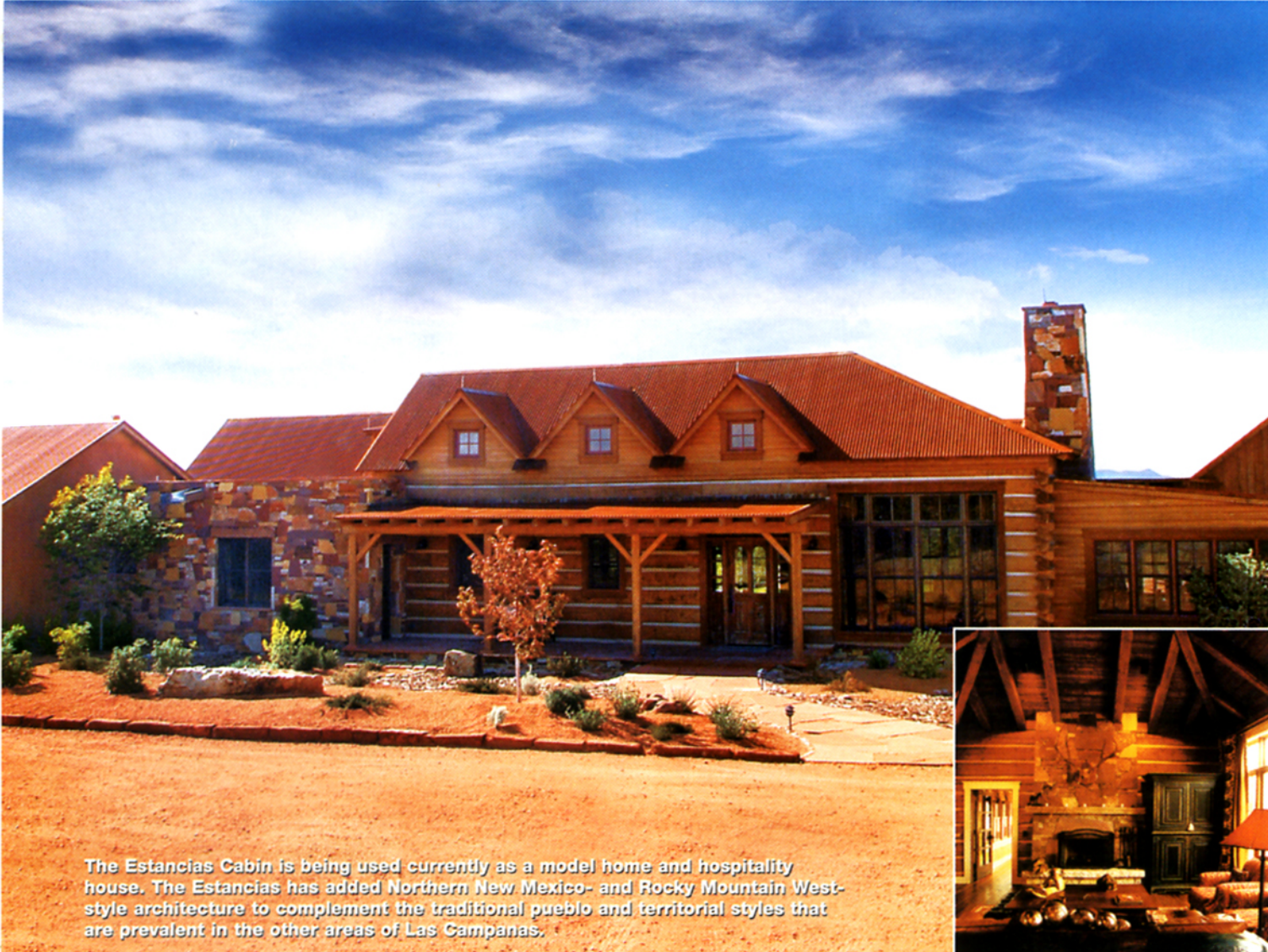
The Estancias Cabin is being used currently as a model home and hospitality house. The Estancias has added Northern New Mexico- and Rocky Mountain West-style architecture to complement the traditional pueblo and territorial styles that are prevalent in the other areas of Las Campanas.