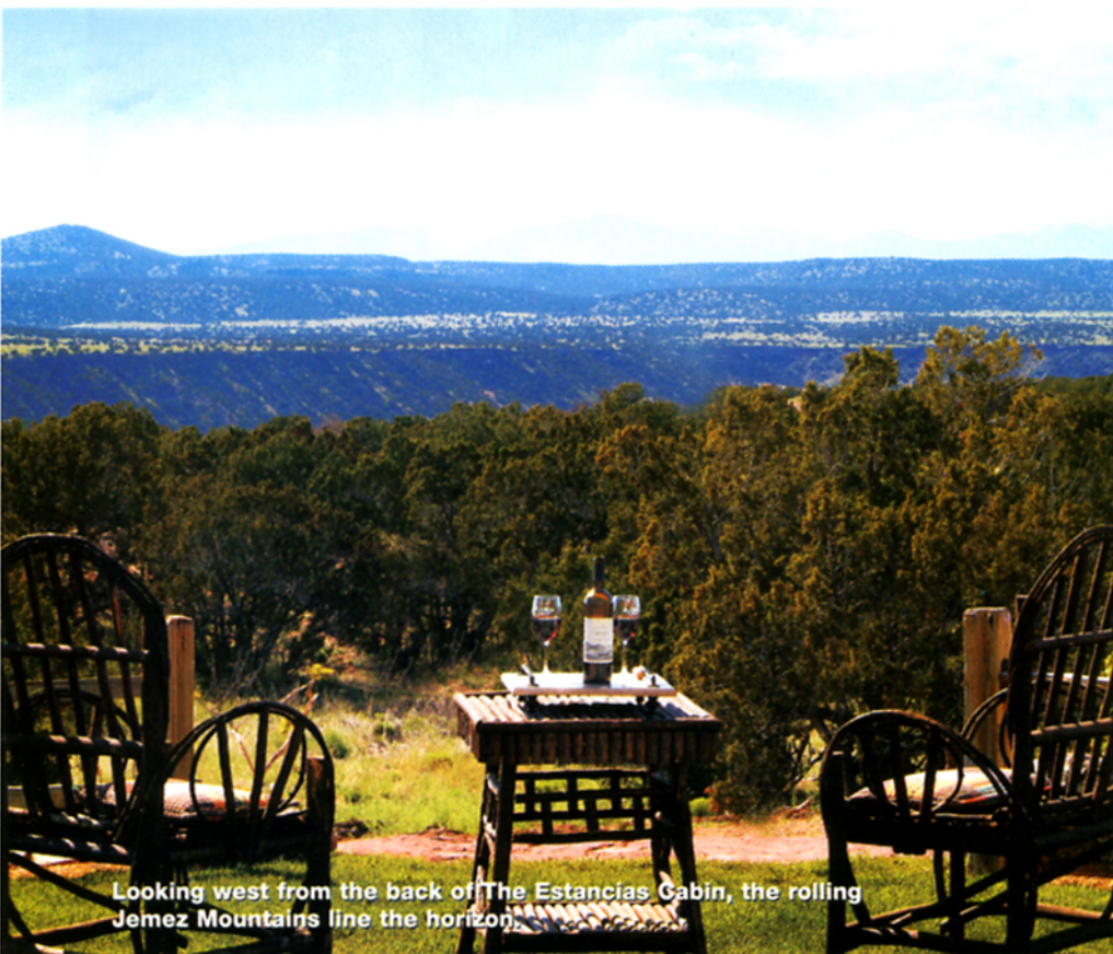
Looking west from the back of The Estancias Cabin, the rolling Jemez Mountains line the horizon.